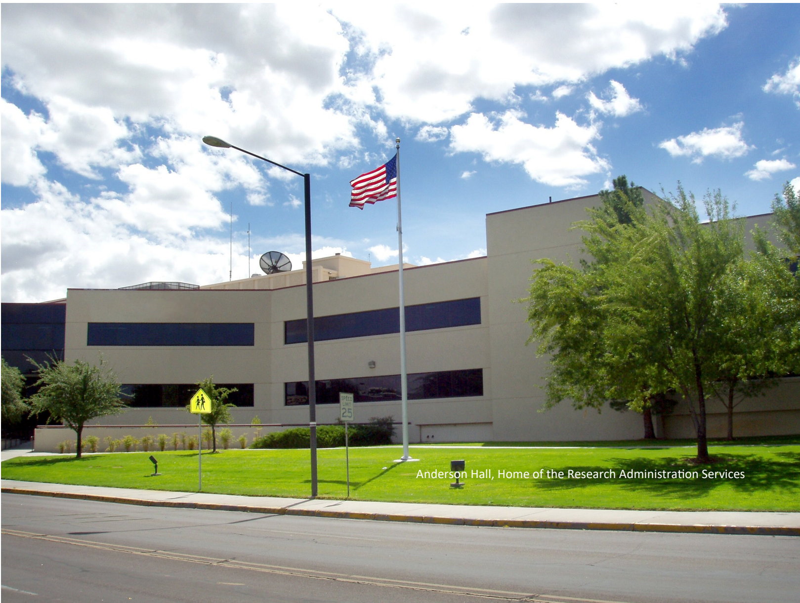
Anderson Hall, Home of the Research Administration Services