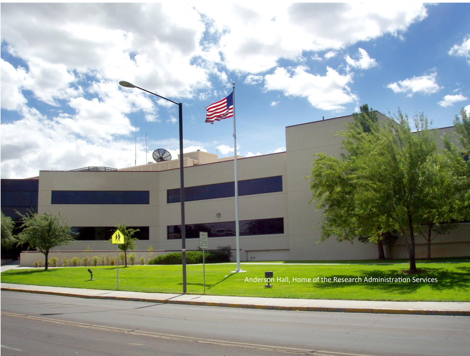
Anderson Hall, Home of the Research Administration Services