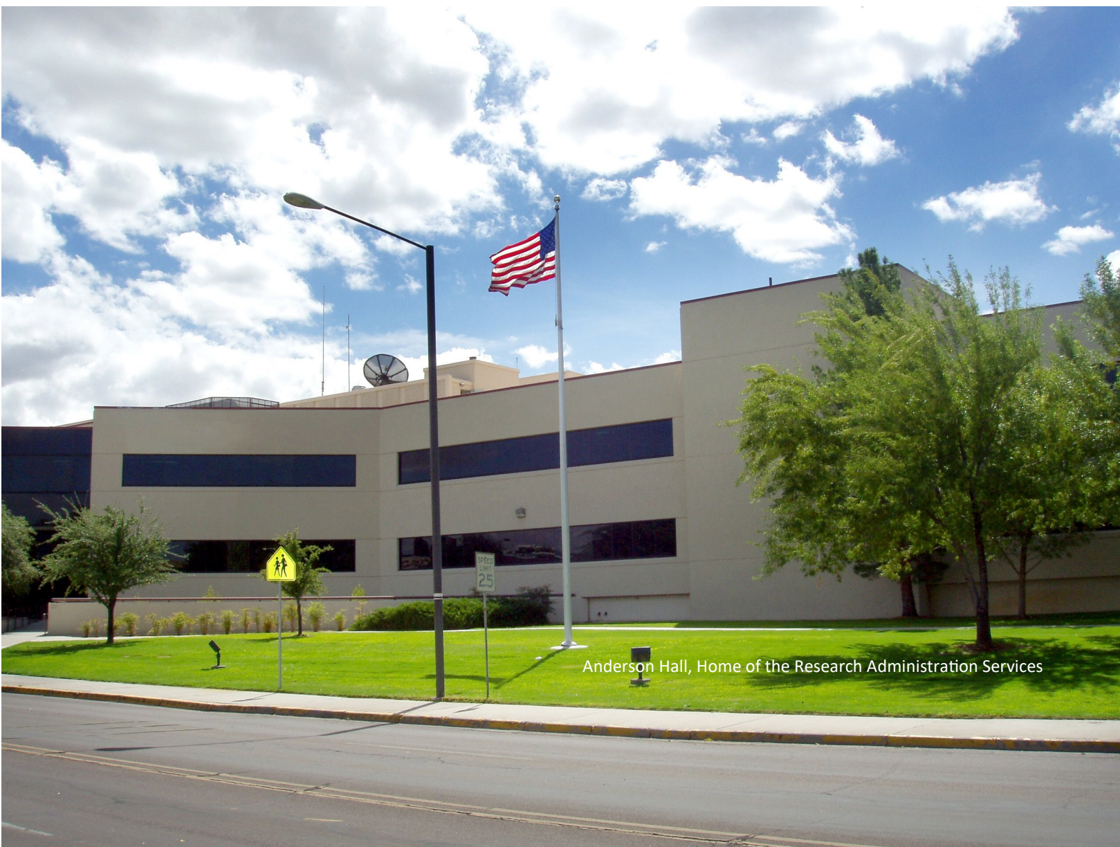
Anderson Hall, Home of the Research Administration Services